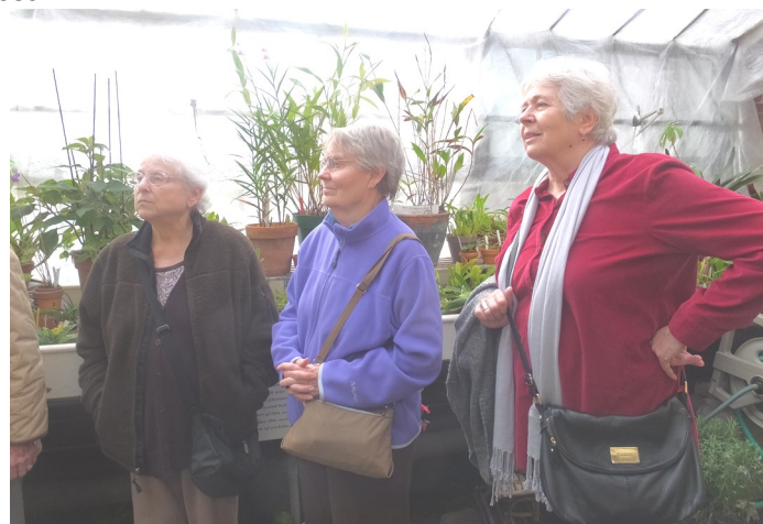
Lyman Greenhouses Tour