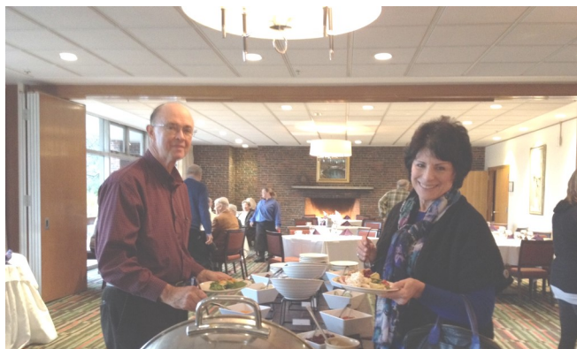
Wellesley College Club Lunch