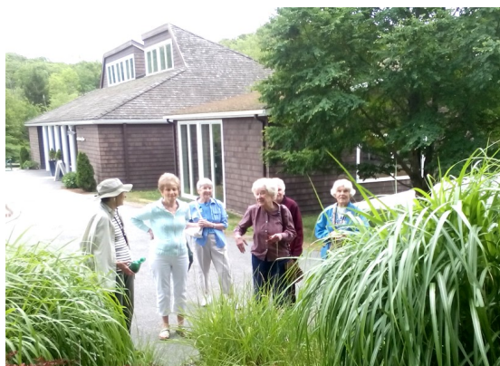
Touring the De Cordova Museum