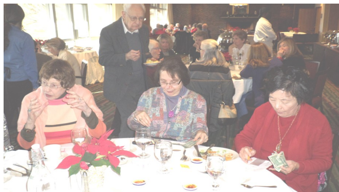
Lunch for all at the Wellesley College Club