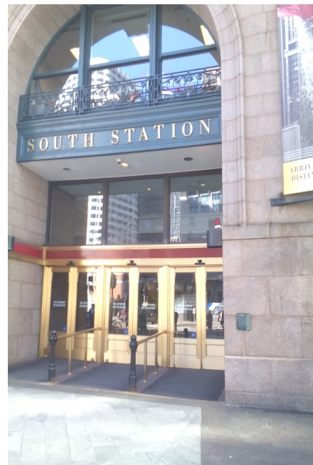
South Station Tour, Boston