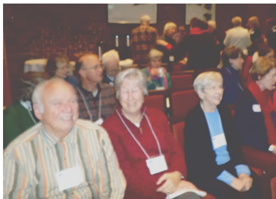
Audience at the Silent Picture Program