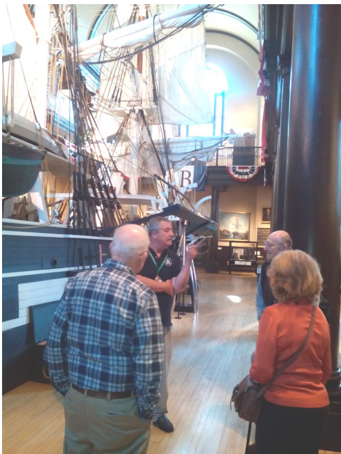
New Bedford Whaling Museum Tour