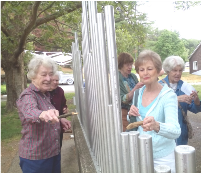
deCordova Musical Fence