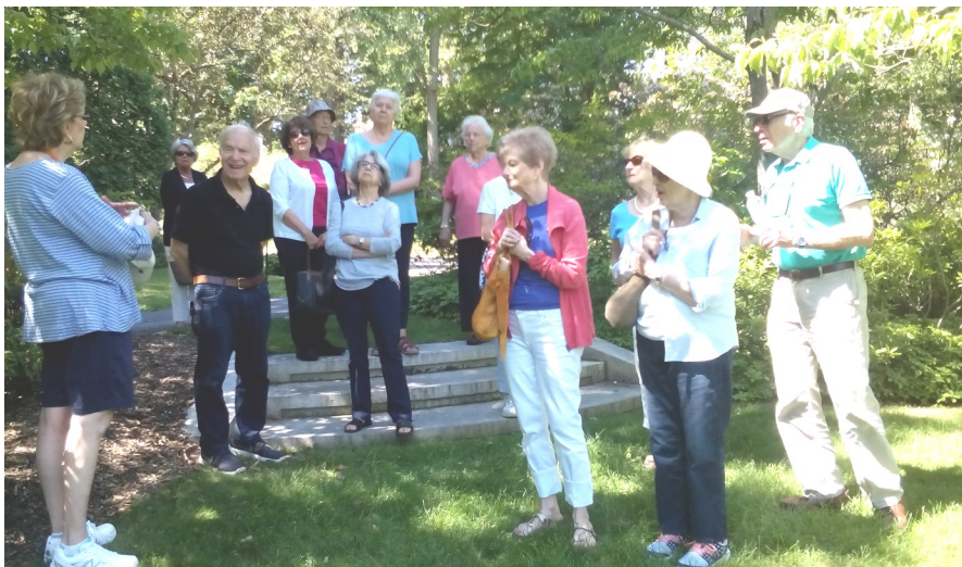
Mt. Auburn Cemetery Tour