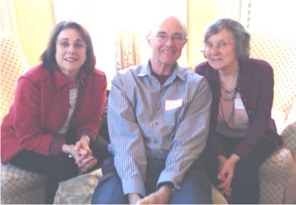
New Members Coffee