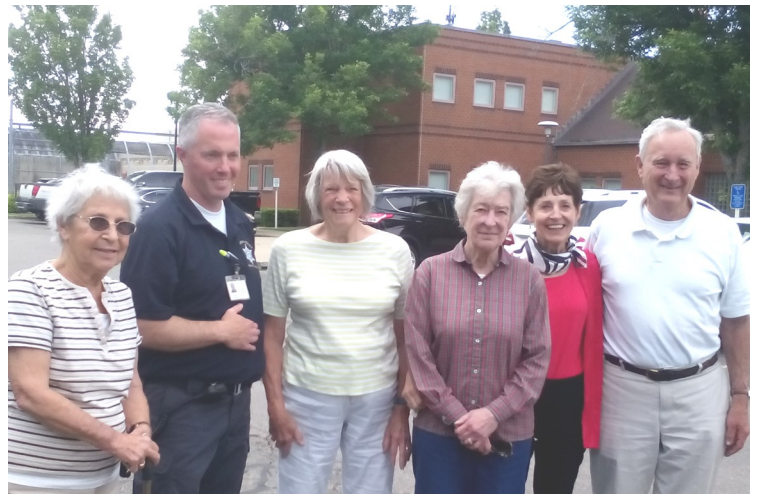
Norfolk Correctional Center Tour