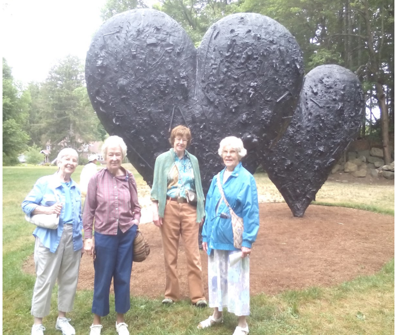
deCordova Big Black Hearts